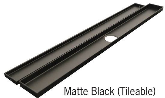
Matte Black (Tileable)