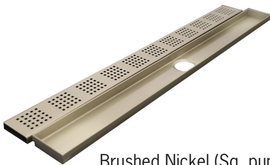
Brushed Nickel (Sq. punch)