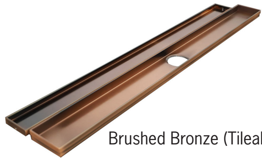
Brushed Bronze (Tileable)